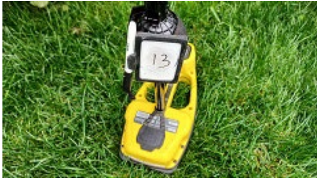
The connection to the city sewer about 13 feet deep