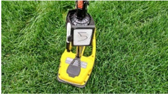
The sewer line traveling across the back yard about 5 feet deep

While the pipe under the building is outside of the scope of this inspection, we sometimes are able to view portions of that pipe. This section of the system is known as the “building drainage system”. The selections below describe any pipe viewed under the structure today.