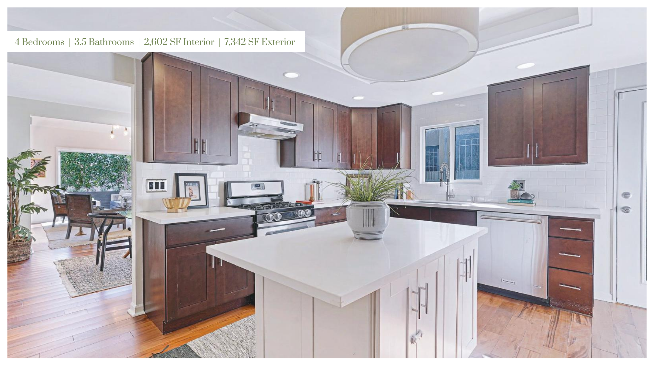
List price: $1,649,000 Directions: In Longwood Highlands. South of Olympic Blvd, Just east of Highland Avenue Address: Il55 S. Rimpau Blvd, Los Angeles, CA 90019 Website: www.ll55Rimpau.com

Light & Bright Modern Country English Home - Perched on a knoll in coveted Longwood Highlands.